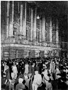
12. Moscow, the House of Unions, 1948. The match tournament is in progress inside